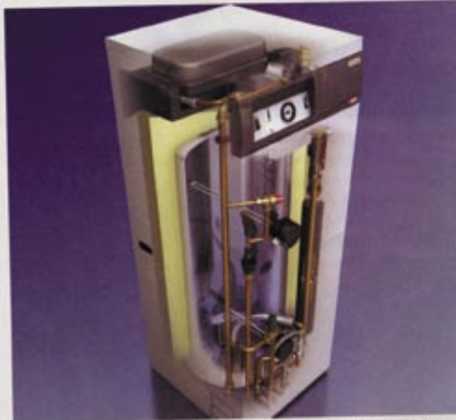
vessel, pumps, controls and connecting pipework, all housed in one unit advantage of the flexible off peak electricity tariffs available. The unvented cylinder also includes a

Electric heating is becoming a popular choice in urban domestic properties. Rather than retaining and then releasing heat like storage heaters, electric wet central heating boilers provide heating and hot water when it's actually needed via conventional radiators or an underfloor system, and are usually coupled with a hot water storage cylinder and controlled by a programmer and thermostat.